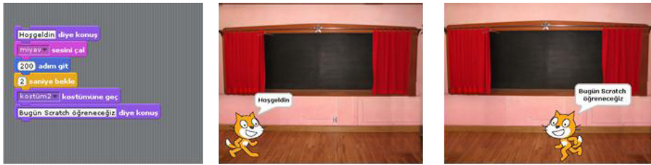
Fig. 1. Screen captures from Hello World program.