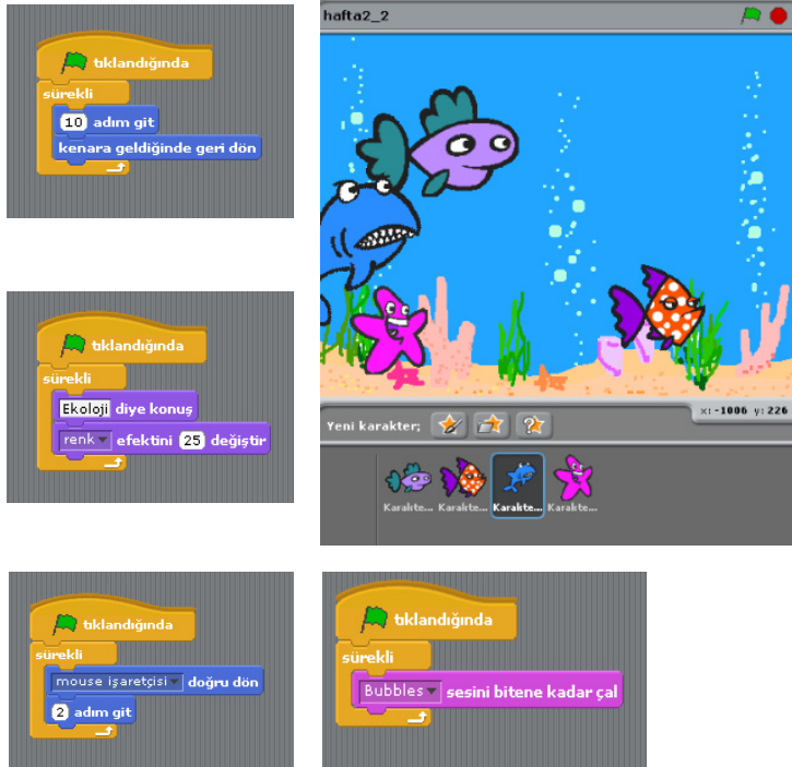
Fig. 3. Screen captures from Aquarium program.